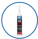
ASI 335 Neutral Cure Silicone Advanced Adhesion Broad Application Use