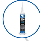
ASI 600 High-Temp Silicone Resists Intermittent Temperatures up to 600°F