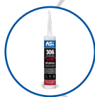
ASI 306 Flowable Electronic Grade Silicone Use on Electronics or a Self-Leveling Joint Sealant