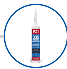
ASI 335 Window Sealant AAMA Approved Use in Manufacturing or Installation