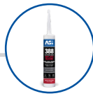
ASI 388 Electronic Grade Silicone UL Recognized, Use for Encapsulating, Bonding, Etc.