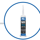
ASI 509 Aquarium Sealant High Tensile Strength, Aquatic Life Safe Silicone

Additional neutral cure silicones sub types: Alkoxy & Methoxy . Acetone silicone also available. Advantages and disadvantages are seen with each. ASI does supply these products as well as specialty products needed per application. What is listed is just a "standard offering" and not representative of the hundreds of products we offer.