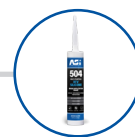
ASI 504 Multi-Purpose Silicone Bonds to Common Substrates, General Applications