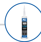
ASI 505 Self-Leveling Silicone Fast Skinning Self-Leveling Joint Sealant