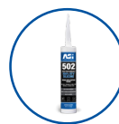
ASI 502 100% Silicone Mold & Mildew Resistant NSF Approved, Food Grade, UL Recognized Sealant