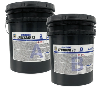
B5G-CBET3-A / B5G-CBET3-B