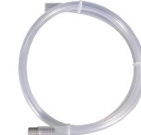
Nozzle Extension Tubing TUBE916-EXT