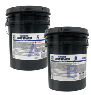
B5G-V200-A / B5G-V200-B